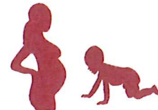
Mother to Baby During Pregnancy, Birth, or Breastfeeding