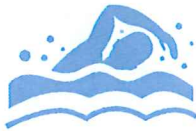
Air or Water