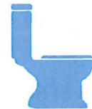
Sharing Toilets, Food, or Drinks